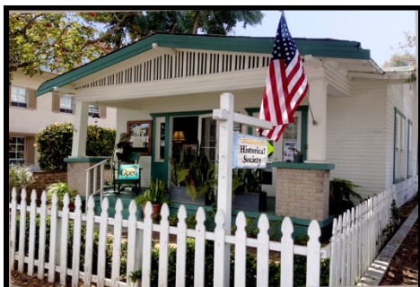
(Information revised 11/2018)

The Laguna Beach Historical Society is an all-volunteer private organization. We are a non-profit; tax exempt California Corporation, founded in 1989. [Section 501(c)(3) non-profit organization. Tax ID #33-0519882.]