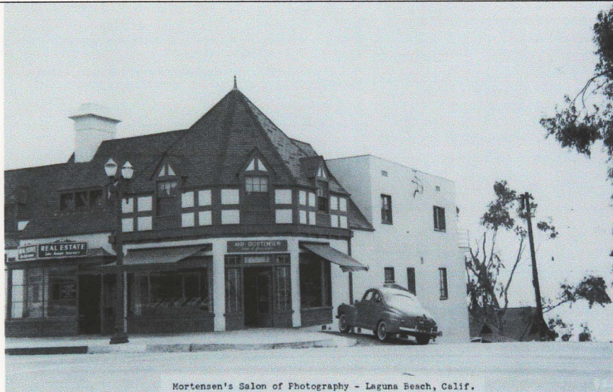
Mortensen's Salon of Photography - Laguna Beach, Calif.