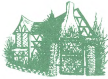
125 Cedar - 1925