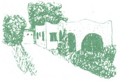
385 Locust - 1929