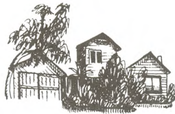
1296 Catalina - 1922