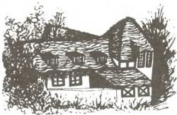
339 Cleo - 1932