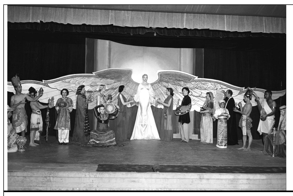
Tableau vivant, Laguna Beach Festival of the Arts -Pageant of the Masters, 1950