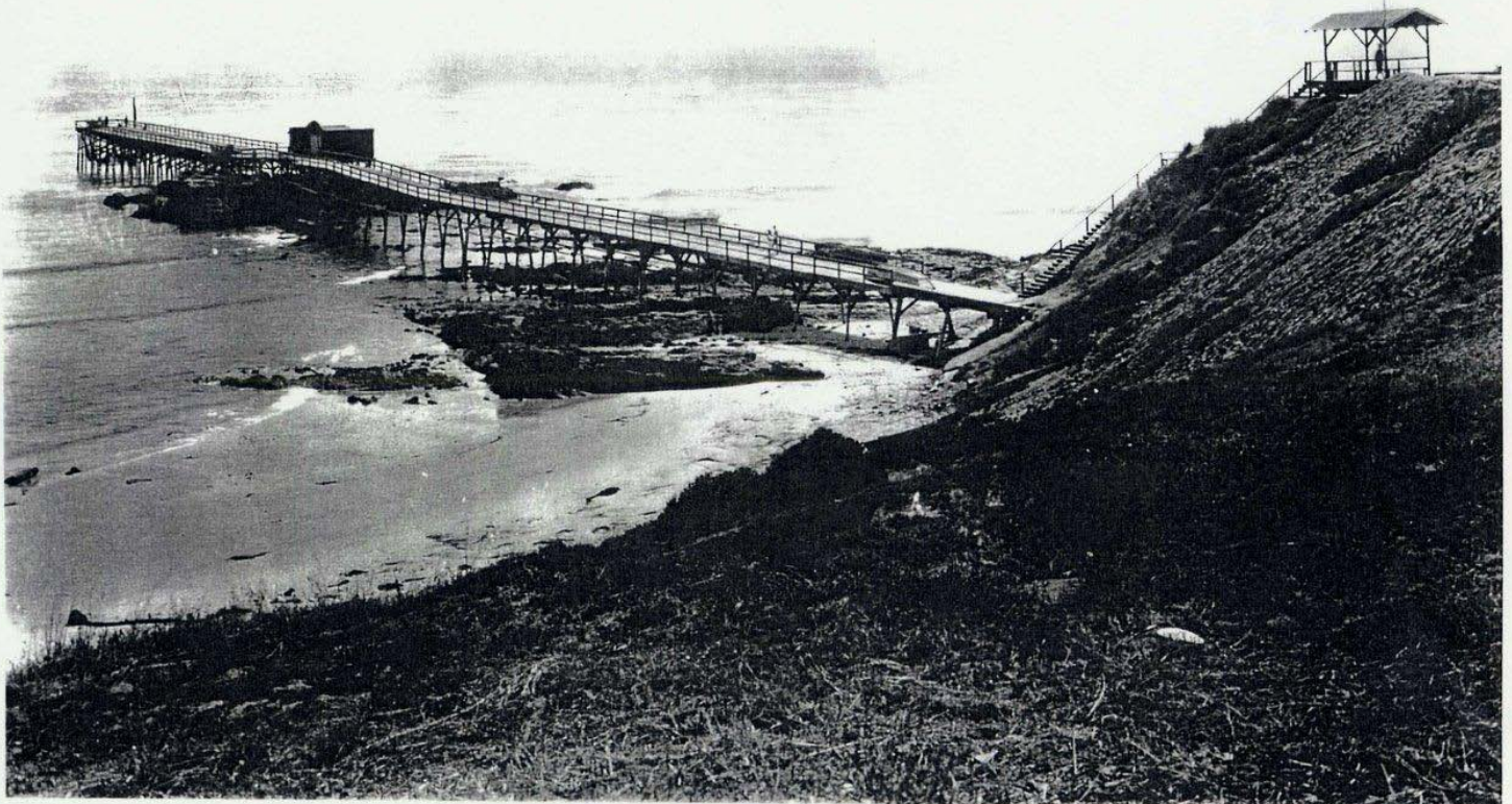
1930's - View of Pier before storm. Laguna Beach.