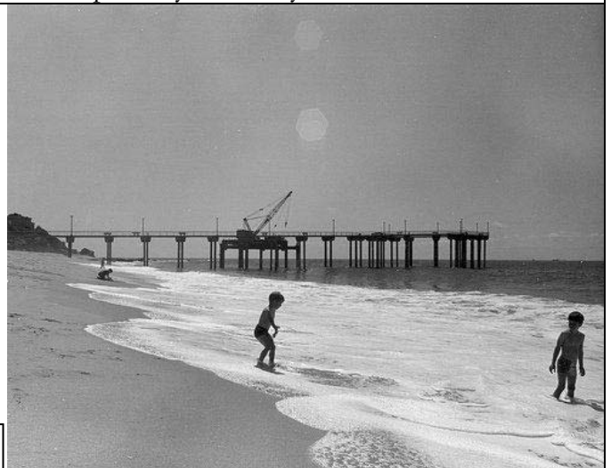
Aliso Beach Pier