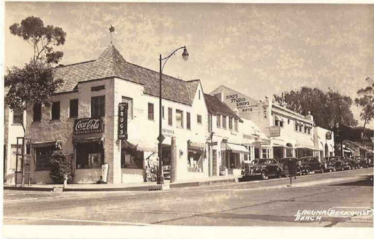
Rawson's Pharmacy in the Heisler Building