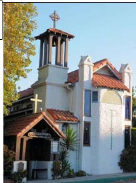
St. Francis by the Sea Cathedral built 1933

View Laguna Photos at www.Laguna-Historical-Society.smugmug.com