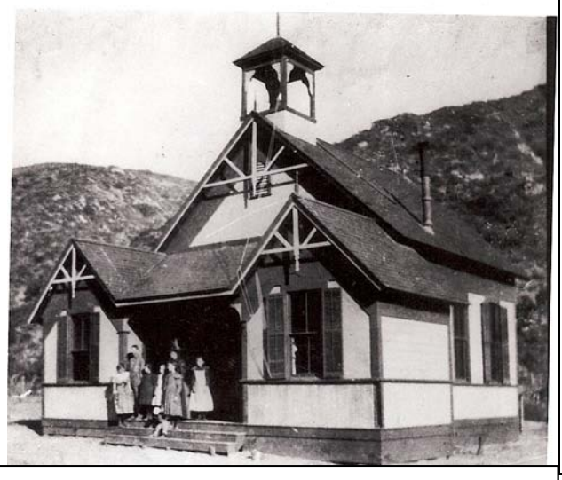
Mormon School House at El Toro Road and Laguna Canyon Road