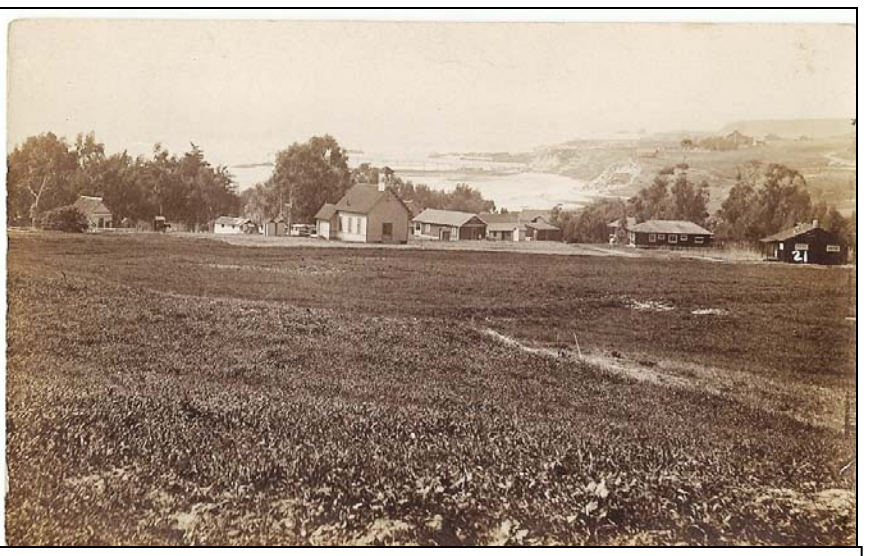
Mormon School as Catholic Church on Aliso Street (now Catalina Street)