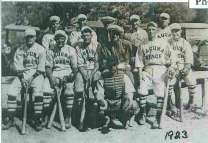
1923 Laguna Beach Baseball Team