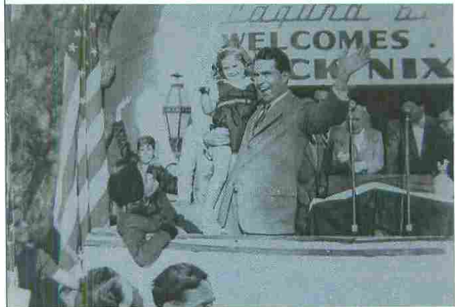
Richard Nixon Campaigns in Laguna