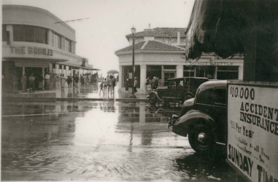
1928 - July 4, raining at Ocean Avenue and South Coast Blvd., now Main Beach Park.

This photo was provided by the Laguna Beach Historical Society to local newspapers. See bottom which reads "1928 - July 4, raining at Ocean Avenue and South Coast Blvd., now Main Beach Park".