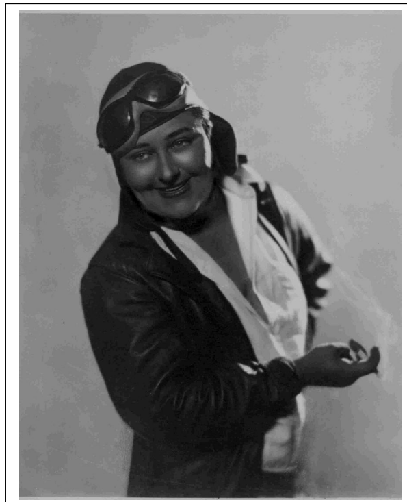
Hurrell Photo of Aviatrix Pancho Barnes