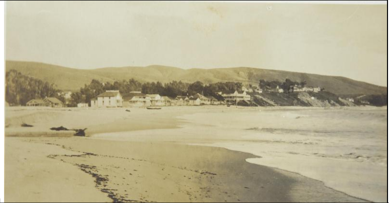
"Laguna a Thing of Beauty" Main Beach photo included in 1908 book "Stories of Laguna" Nate Brooks white house towards left