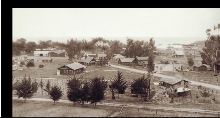
Community Presbyterian Church downtown at 2nd Street and Forest Avenue Laguna Chapel or "Little Brown Church" [center a bit to left] built in 1915