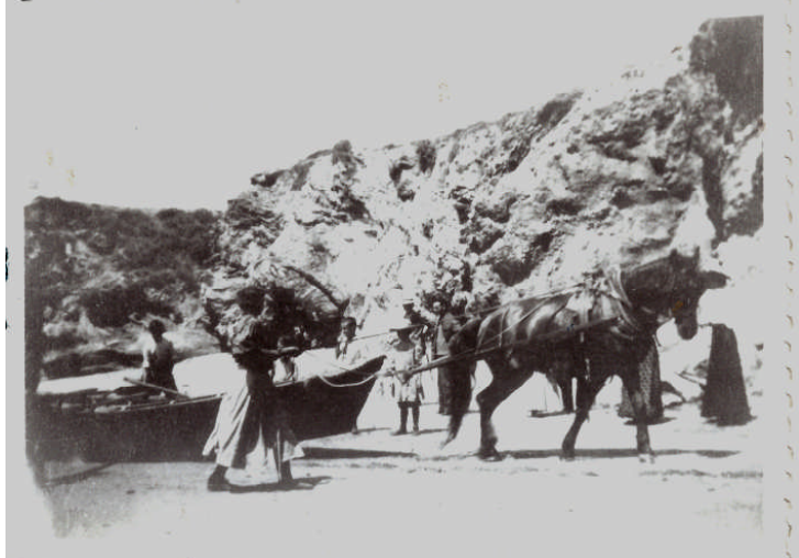
Josie Derkum Rice meets brother's fishing boat at Boat Canyon - Fisherman's Cove