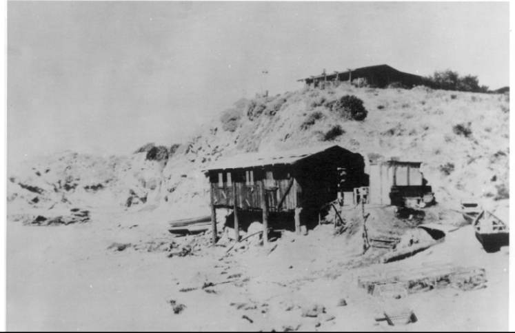
Fisherman Hut Boat Canyon - Fisherman's Cove Built in 1913 by Refugio Coronado and Jovencio Duarte; 1928 Photo shows Cowboy Movie Star Tom Mix House

Merle and Mabel Ramsey in their book "The First 100 Years in Laguna Beach 1876 - 1976" write the following [page 36-37] :