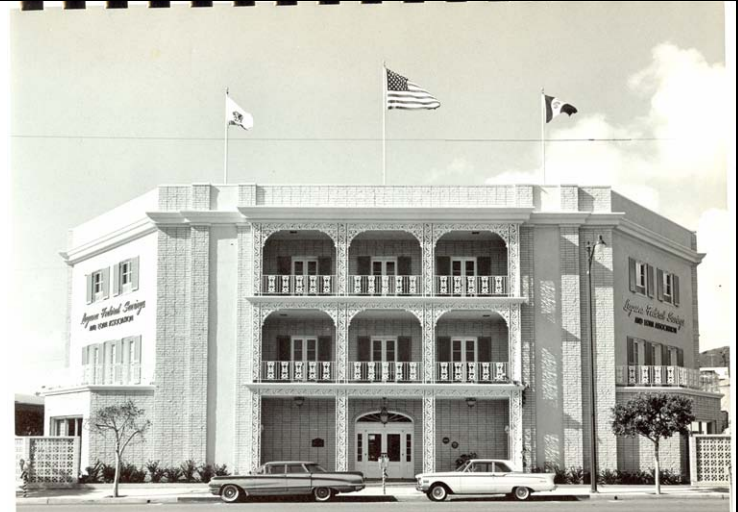
Laguna Federal Savings at 260 Ocean Avenue