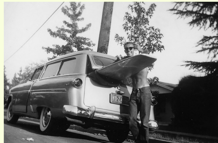
circa 1952: Resting on his Bolsa surfboard on the back of his new station wagon.