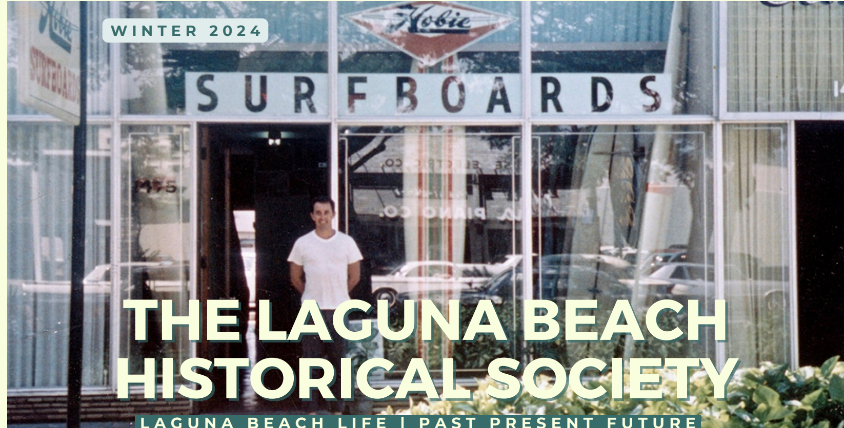
1961 Metz in front of the Hobie shop on Kapiolani Boulevard in Honolulu.

Laguna Beach Historical Society 278 Ocean Avenue Laguna Beach, CA 92651