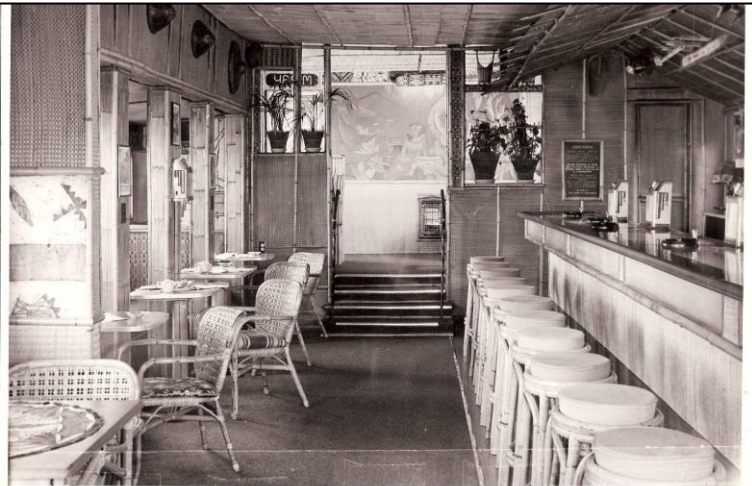
Coast Inn Boom Boom Room Lower Bar Carvings at rear by Mogens Abel