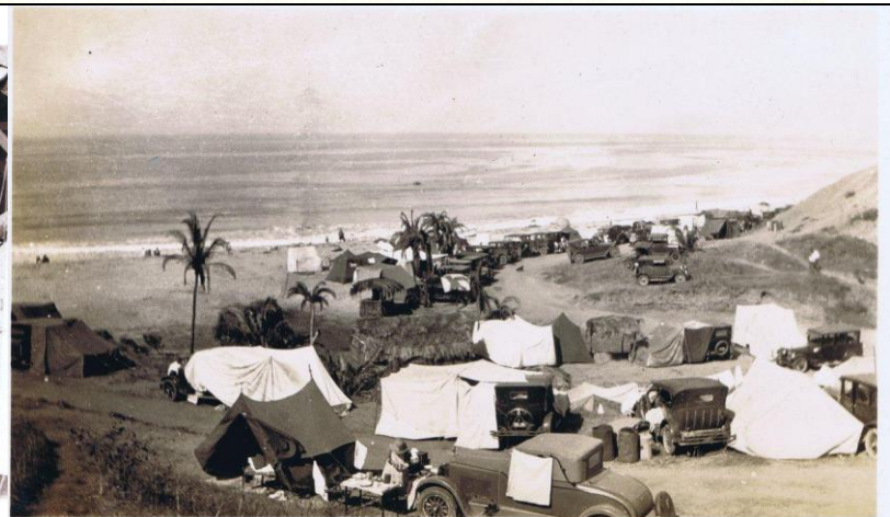
Crystal Cove 1927