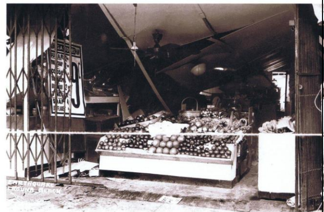
230 Forest Avenue Forest Market Damaged After 1933 Earthquake