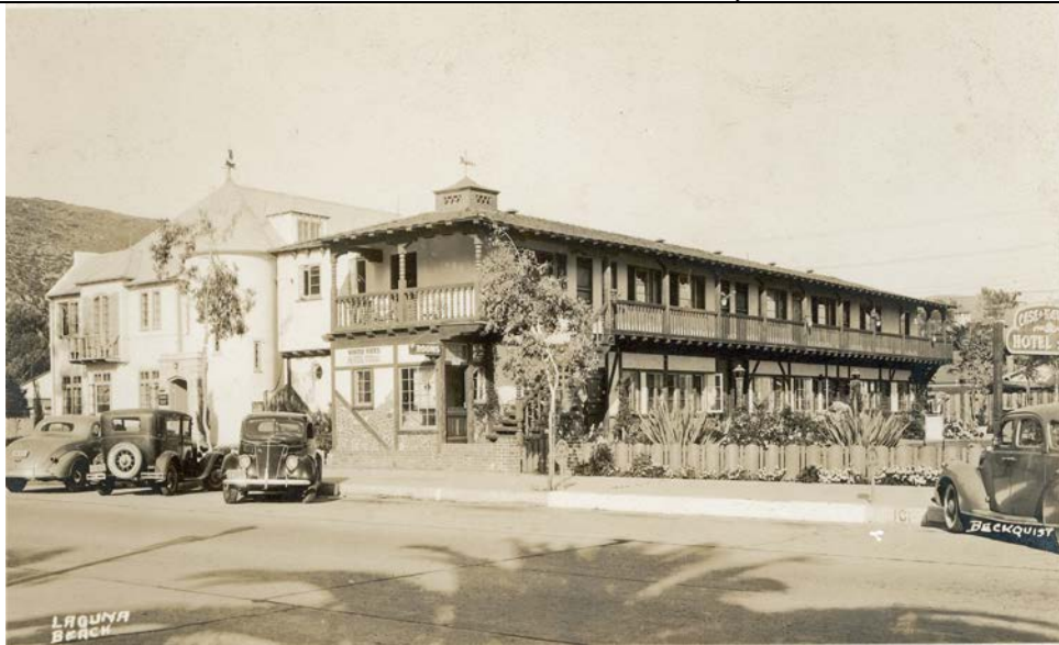
Chateau Getting Ready for Move. The Laguna Federal Savings building (now Wells Fargo Bank) is at the right.