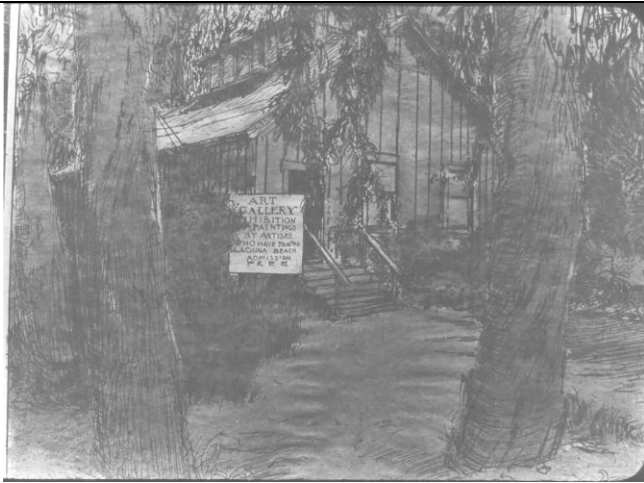
Pavilion built 1900 in what is now parking lot of Hotel Laguna converted to Art Gallery 1918