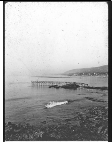
Main Beach Pier at Heisler Point Pass Bird Rock Built 1926 Damaged 1939