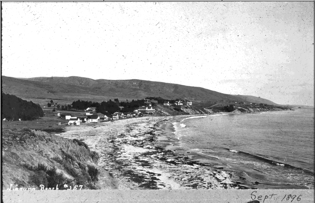
Main Beach September 1896