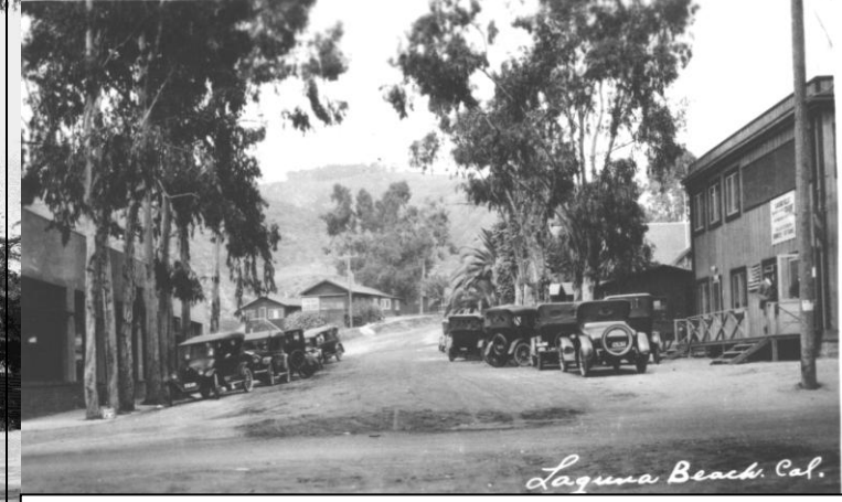
The Villa (at the rightside) Laguna Avenue at South Coast Boulevard