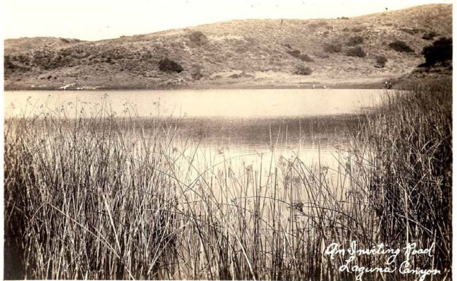
An Inviting Road Laguna Canyon Lake 1920-30s