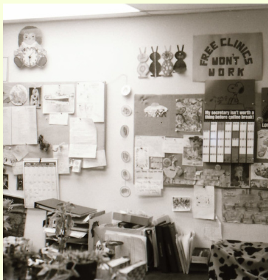
The office of The Free Clinic on Ocean Avenue