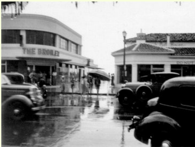
Main Beach Restaurant: The Broiler

Laguna Beach Historical Society 278 Ocean Avenue Laguna Beach, CA 92651