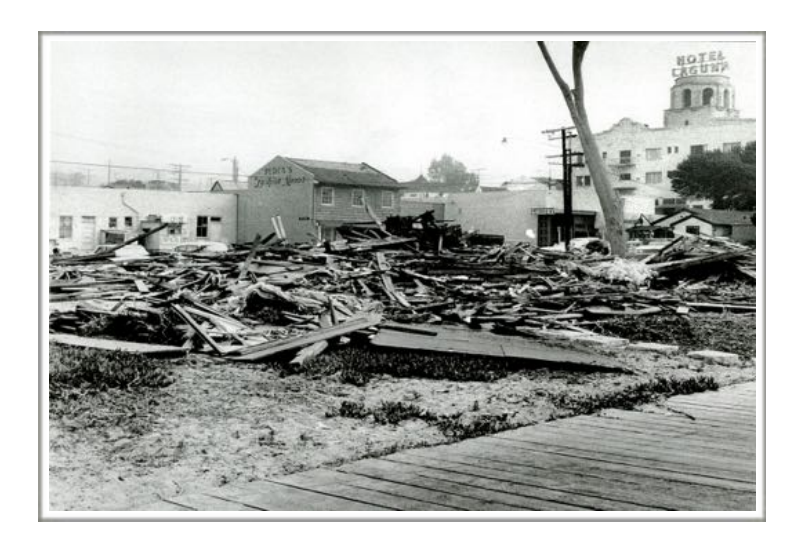
Cottages torn down 1968