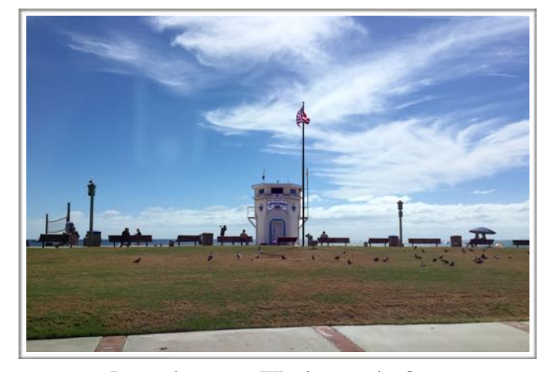
Laguna's current Window-to-the-Sea