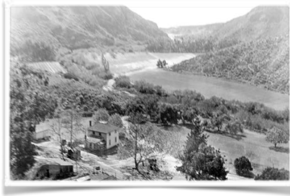
Thurston Ranch, 1890s

Enclosed to help you decide the level of support you would like to give to us. THANK YOU!