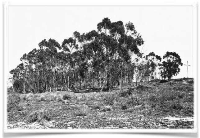
Gum Tree Grove at Top of the World First American Title