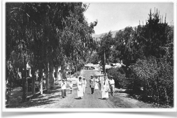
Coast Road near the old hotel (now Hotel Laguna)

While perusing photos from our archives, I noted the many eucalyptus trees that were so prevalent decades ago. It seems we have a love/hate relationship with the Australian native “gum tree.”