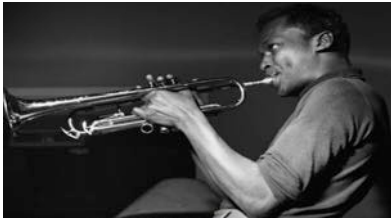
MILES DAVIS

El Morro Beach has a trailer park for camping across Coast Highway. The Pottery Shack is selling Fiestaware. There is a burger stand steps from the lifeguard tower on Main Beach. The local cinema plays Best Picture, "All About Eve" starring local resident Bette Davis. Travelers check in to the Coast Inn, sporting the Spanish Colonial architecture. And at the White House Restaurant, jazz musicians cover the just released "Birth of the Cool" by 24-year-old Miles Davis.