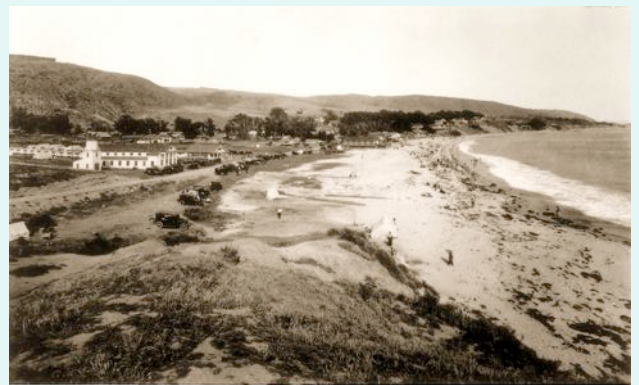
100 Laguna Beach, California