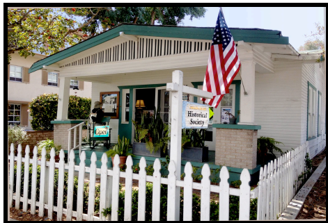
(Information revised 04/2015)

The Laguna Beach Historical Society is an all-volunteer private organization. We are a non-profit; tax exempt California Corporation, founded in 1989. [Section 501(c)(3) non-profit organization. Tax ID #33-0519882.]